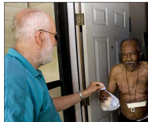
A Meals On Wheels And More volunteer delivers a nutritious lunch.

Just as concepts and technologies evolve, language changes to meet the new ways we talk about our environment. Moving into evermore common usage is something called " food insecurity ." It's a curious term used primarily by people who speak the language of 'government-ese', many of whom determine food policy and complex aid programs on national and international levels. But what exactly does this term mean and what do we need to understand about it?