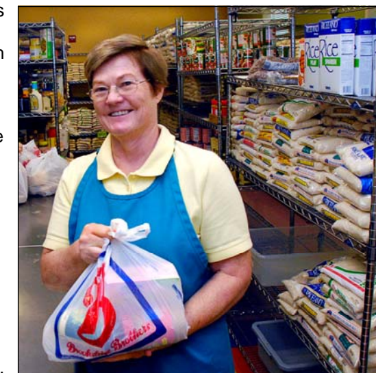
Food Pantries like El Buen Samaritano's help reduce hunger in the community.