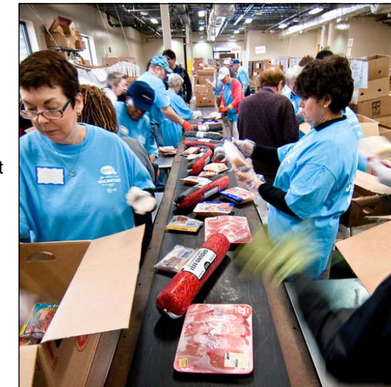
Volunteers help The Capital Area Food Bank distribute food to hungry Texans.

Hunger is a result of food insecurity , but it is not synonymous. When we hear food insecurity being discussed, we can understand that hunger is a critical component of the term. Hunger definitely exists here in Central Texas, and it is something that we can do something about. We have to credit the Capitol Area Food Bank for using the following words in a new organizational tag-line - in our Central Texas community, HUNGER is UNACCEPTABLE!